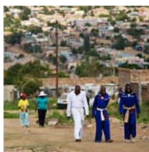
After Mandela, a Test at the Polls for His Party

Are digital currencies like bitcoin a rival to the dollar? Or, with so many paperless options, should the U.S. at least stop printing currency?