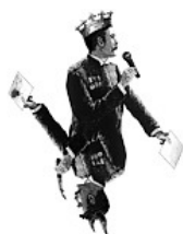
Op-Ed: Why Machiavelli Still Matters