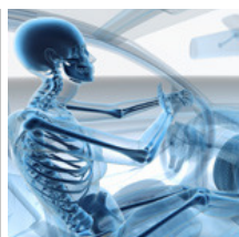
When Is It Safe to Drive After Breaking a Bone?